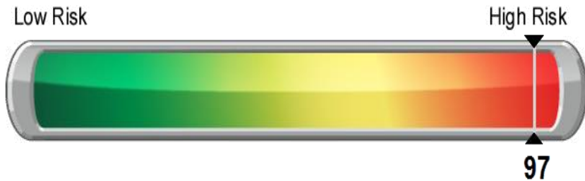
Current Risk Score